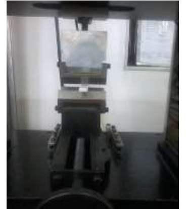
Fig 1: Flexural Modulus Setup

[Gupta* et al. , 5(6): June, 2016] IC<sup>TM</sup> Value: 3.00