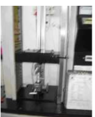
Fig 2: Universal Tensile tester